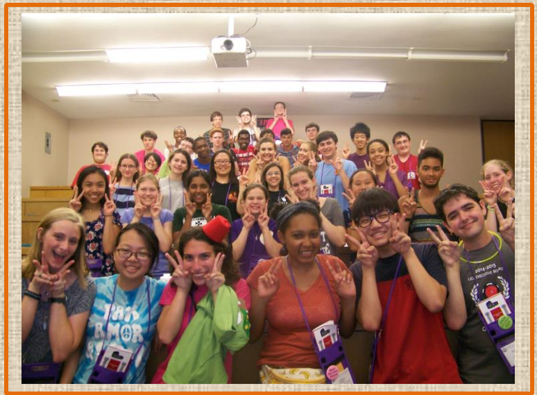
The LJCL Delegation at the 62 nd NJCL Convention